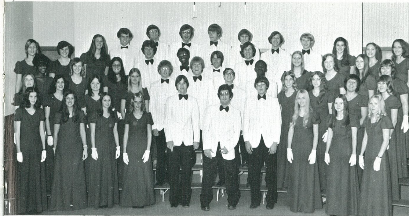
1974-75 Yellowjacket Choir